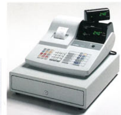
240CR with DL-2762 drawer (Also available Model DL-1832 drawer)